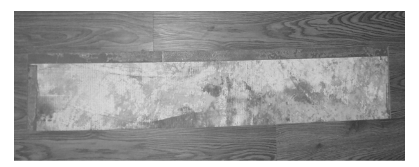
Figure 7 Figure 8

If strip is damaged then please replace using alternate method below. On "Over lip" StarlocStrip on adjoining plank use heat gun to soften adhesive and peel back original "Underlip" StarlocStrip on side and butt end of plank (Figure 9)