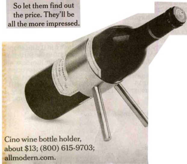
Cino wine bottle holder, about $13; (800) 615-9703; allmodern.com.

So let them find out the price. They'll be all the more impressed.