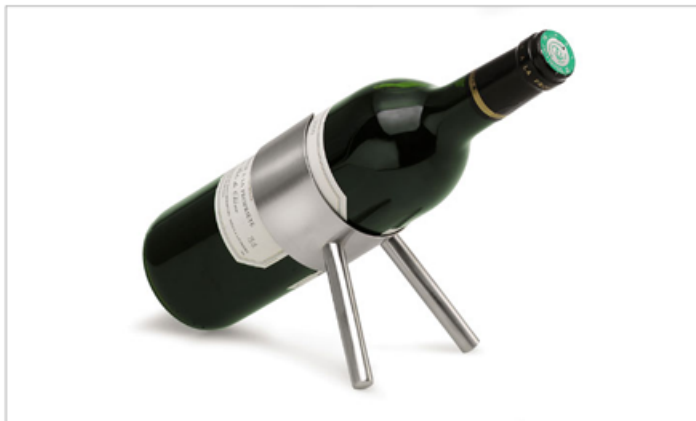
Cino wine bottle holder, about $13; (800) 615-9703; allmodern.com.