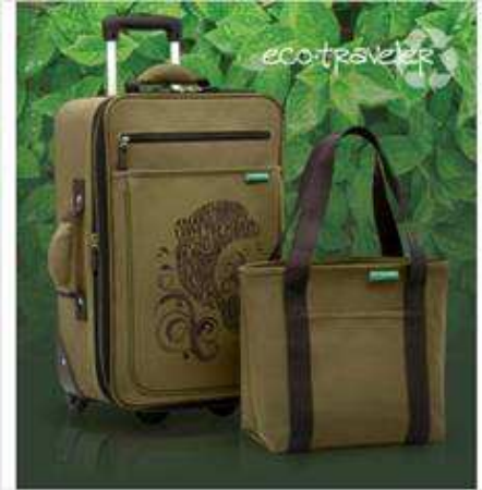
8. Traveler's Choice – Eco Traveler 2-Piece Expandable Carry-On Set – Constructed of natural hemp canvas with dolphin print and eco-friendly PVC-foam for extra support and durability. ($71.99, Luggage.com)