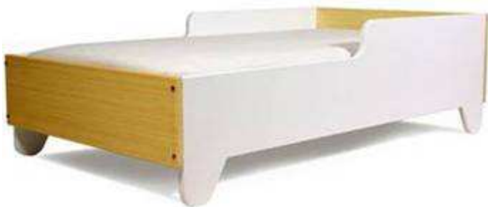
10. Spot on Sqaure – Hiya Toddler Bed in Bamboo/White - Designed by real parents who provide modern moms and dads with modern, eco-solutions for their toddlers. ($625, BedroomFurniture.com)